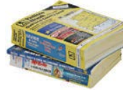
Phone Books All types and sizes