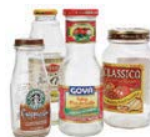
*Clear and Colored Glass Empty containers only