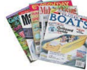
Magazines & Catalogs Any size magazine