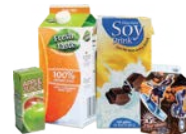
Paper Milk or Juice Cartons Empty cartons only