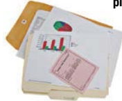
Office Paper All types and sizes