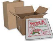
Cardboard & Paper Bags Flatten cardboard & cut into pieces. No wax coated cardboard