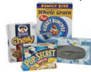
Paperboard No wax coated paperboard