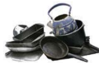
Pots & Pans Kitchen cookware