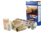
Consumer Packaging *new to recycling program