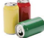
*Aluminum Cans Empty cans only