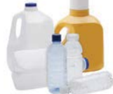
*Plastic Jugs/Bottles (#1 & #2)