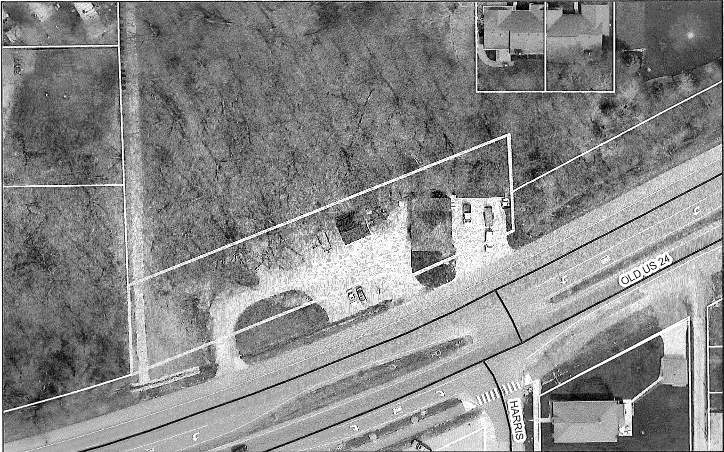
Aerial & Existing Zoning